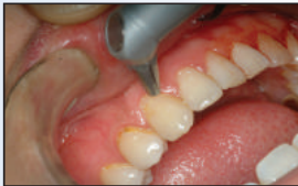
Hypersensitive (cervical) Hypersensitive (occlusal surface)