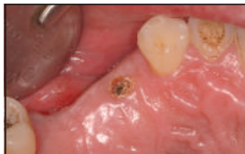
The 2nd implant operation