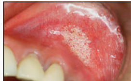
Painless Anesthesia Operation by Laser