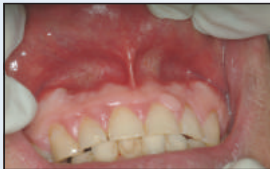
Gingival Excision and Gingival Plastic Operation